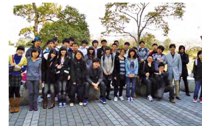
Walking around the Campus