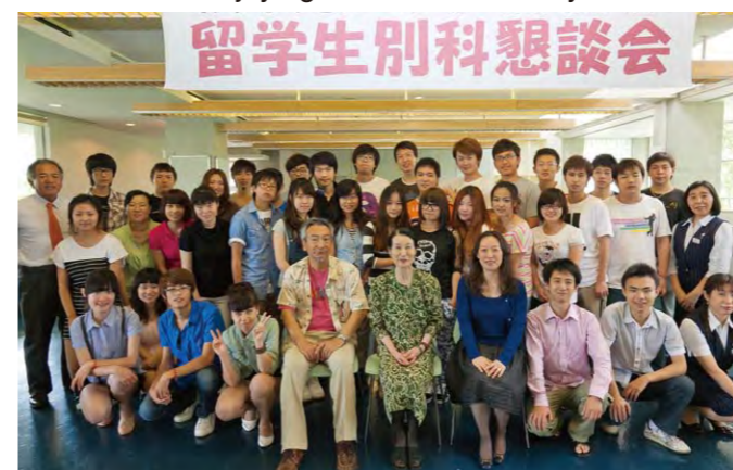
Enjoying the Welcome Party